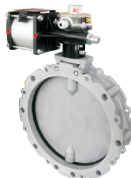
| Pneumatic Powder Butterfly Valve. Disc : aluminium Alloy