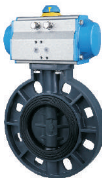
| D671X-10S PNEUMATIC pvc butterfly valve