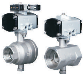
| C-UTFE PNEUMATIC ball valve