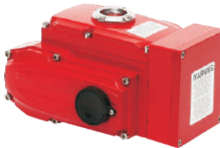
| ODL ELECTRIC ACTUATOR ( modulating )