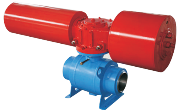
| BTS PNEUMATIC ACTUATOR SINGLE-ACTING