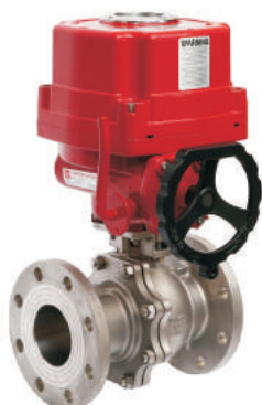
| Q941F-16P EXPLOSION proof electric ball valve