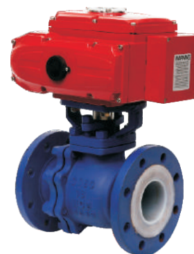
| Q641F46-16C ELECTRIC ball valve with teflon