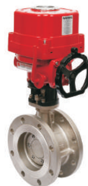
| D943H-16P EXPLOSION-proof electric three-eccentric butterfly valve.