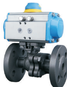
| Q641F-16C PNEUMATIC ball valve