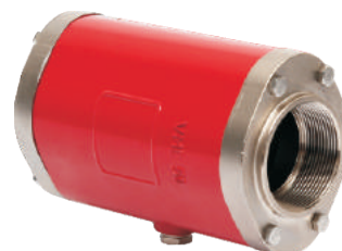
| VMC Pinch valve