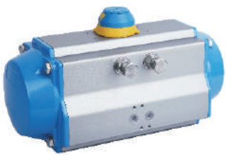
| AT PNEUMATIC ACTUATOR