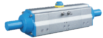
| 3-POSITION PNEUMATIC actuator(0°-45°-90° ) ( 0°-90°-180° )