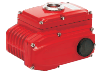
| ODL ELECTRIC ACTUATOR