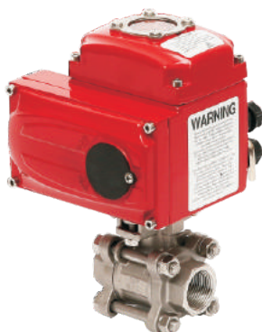
| Q911F-16P ELECTRIC three-piece ball valve.