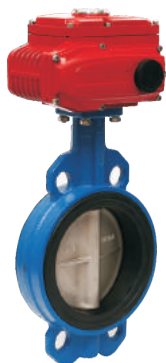
| D971X-10 ELECTRIC center line-type butterfly valve