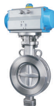
| D672F-16P PNEUMATIC high-performance butterfly valve