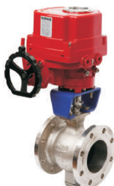
| Q941F-16P EXPLOSION proof electric V type ball valve