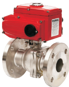
| Q941F-16P ELECTRIC ball valve