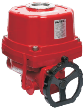
| OHQ ELECTRIC ACTUATOR ( explosion proof type )