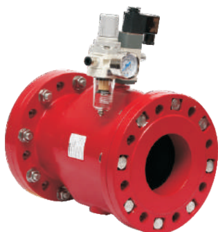
| VF Pinch valve