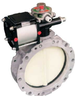
| Pneumatic Powder Butterfly Valve. Disc : polyurethane (pu)