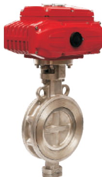
| D972F-16P ELECTRIC high-performance butterfly valve