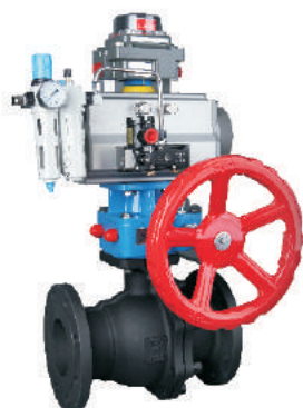
| Q641F-16C PNEUMATIC ball valve