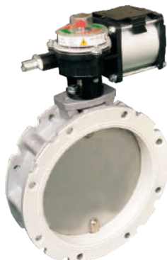
| Pneumatic Powder Butterfly Valve. Disc : stainless Steel+ All Rubber Lined