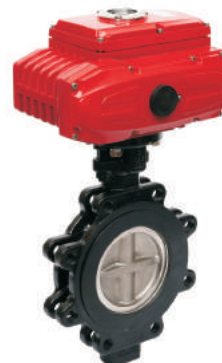
| D972F-16C ELECTRIC high-performance lug type butterfly valve