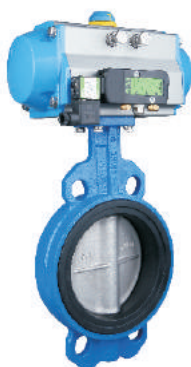
| D671X-10 PNEUMATIC center line-type butterfly valve