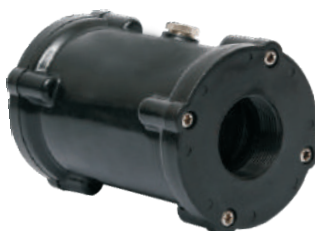
| VMP Pinch valve