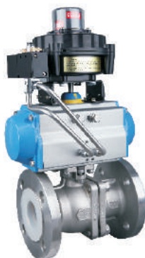
| Q641F46-16P PNEUMATIC ball valve with teflon