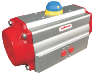
| PT PNEUMATIC ACTUATOR