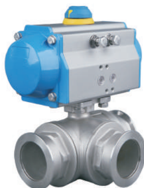
| Q685F-16P PNEUMATIC 3-way ball valve