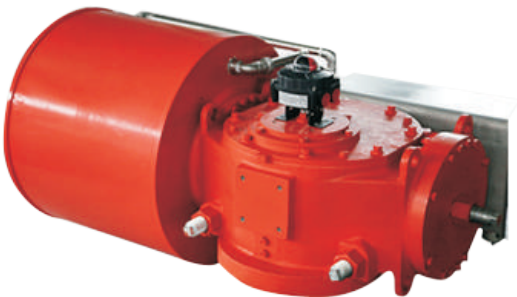
| BTS PNEUMATIC ACTUATOR DOUBLE-ACTING