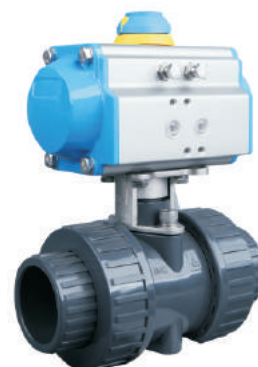
| Q661F-10S PNEUMATIC pvc ball valve